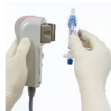
The shunt sensor is placed in the cable head.