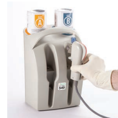
The cable head, with sensor attached, is placed in the calibrator.