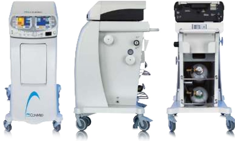
HelixAR™ with ABC: Compact footprint, mobile and fully Integrated.