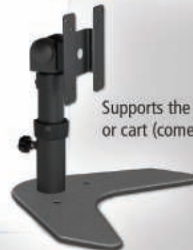
Table Stand FOS1014

Supports the FlowXL on any shelf or cart (comes standard).